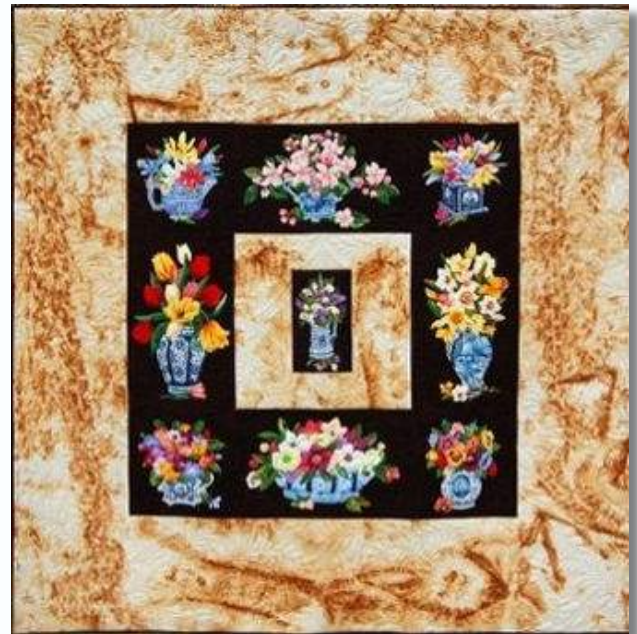
First Place in the Master Quilter Category Springtime Memories (67.5" x 67.25")

This quilt also won the Oh! Canada Award at the 2017 Grand National Quilt Show.