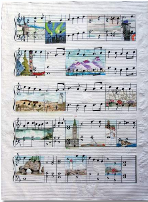
Best in Show Ode to Lavallée (49.25" x 66") by Art Kwilt Connection