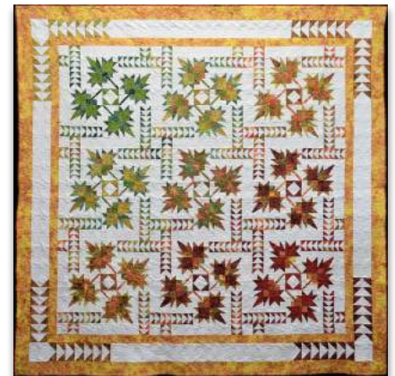
Changing Seasons (101" x 99") by Doreen Bone & Shari Turner Northern Neighbours pattern by Debbie Tucker

There were 3 honourable mention ribbons awarded to the following quilters in the Master Quilter Category: